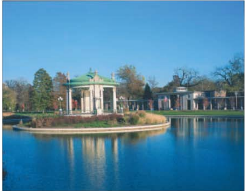
St. Louis Muny Opera

■ ST. PETERS COMMUNITY & ARTS CENTER is known throughout the region as a destination for the arts.