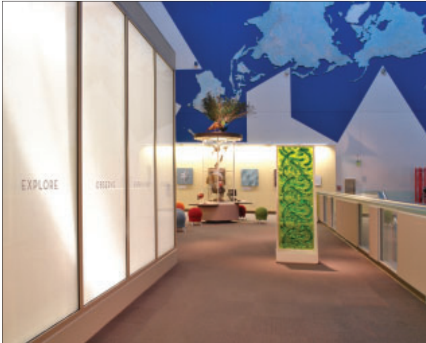
The Saint Louis Science Center's new Life Science Lab.

■ MISSOURI HISTORY MUSEUM* , in Forest Park, houses an extensive variety of exhibits and educational resources focusing on the history of the St. Louis region, the state of Missouri and the American West. The museum also has a major library and research center.