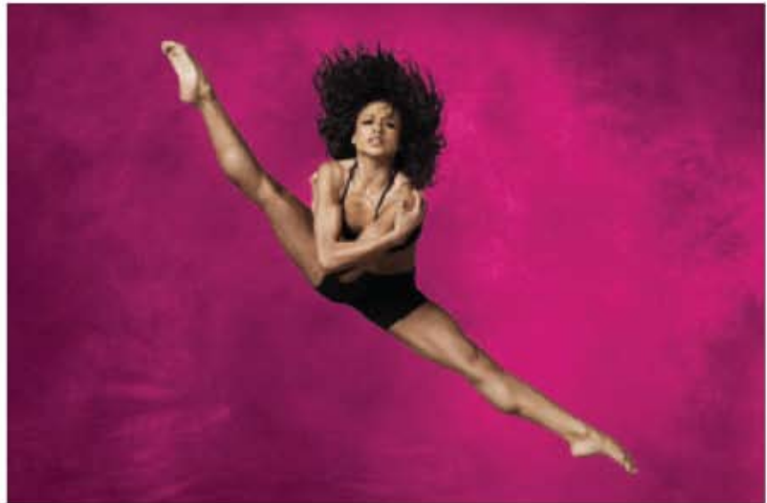
Dance St. Louis

■ GATEWAY MEN'S CHORUS performs a full season series of three major concerts each year.