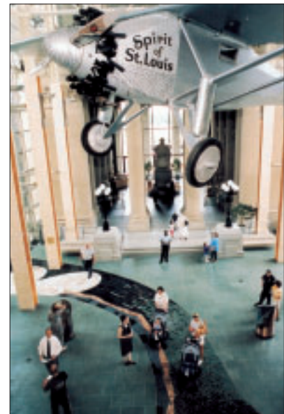
Missouri History Museum

■ WILLIAM AND FLORENCE SCHMIDT ARTS CENTER showcases an extensive college and foundation collections and provides unique opportunities to experience art.