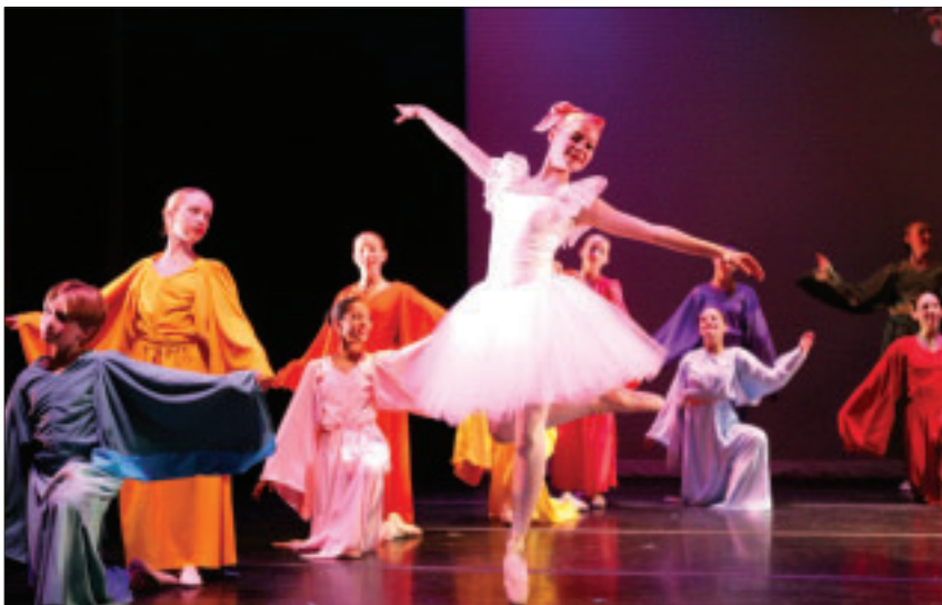
COCA (Center of Creative Arts)

■ THE WEBSTER UNIVERSITY FILM SERIES is a year-round program that prides itself as the most comprehensive alternative film series in the St. Louis area.