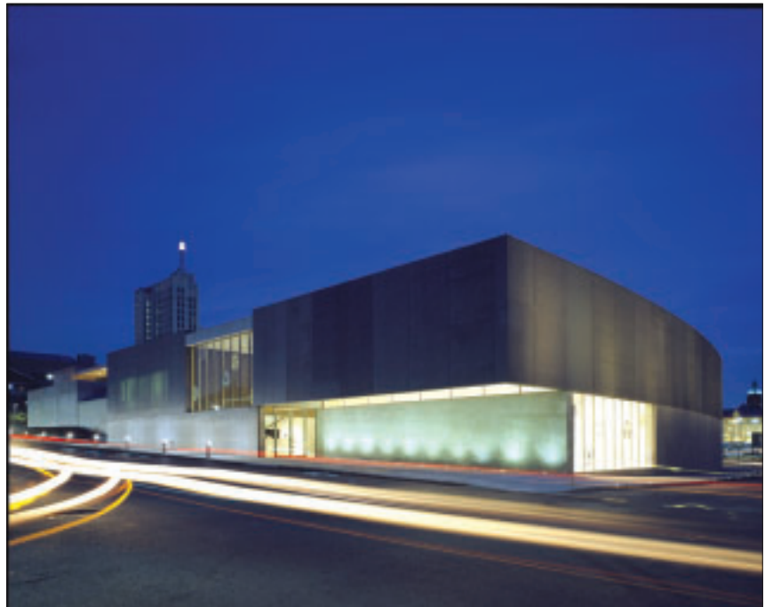
The Contemporary Art Museum St. Louis

■ THE CHATILLON-DEMENIL HOUSE* , built in 1848 and greatly expanded in 1861, is a Greek-Revival style mansion with ties to some of the city's earliest history. The home is open for tours and contains period furnishings as well as a collection of 1904 St. Louis World's Fair commemoratives.