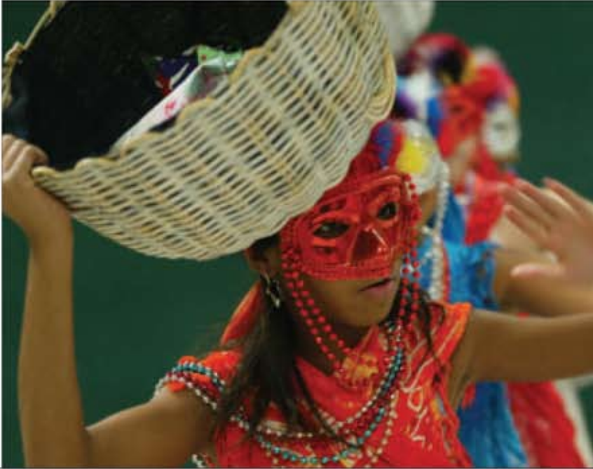
Springboard to Learning & Young Audiences of St. Louis dance festival.

■ CRAFT ALLIANCE is a nationally respected non-profit visual arts center providing inspiration and education to the entire community through exhibitions, instruction and a gallery shop. Located in the Delmar Loop, with a new location open in the Grand Center arts district, the organization offers classes, gallery talks and a community outreach program to continually expose new audiences to the unique qualities of contemporary craft.