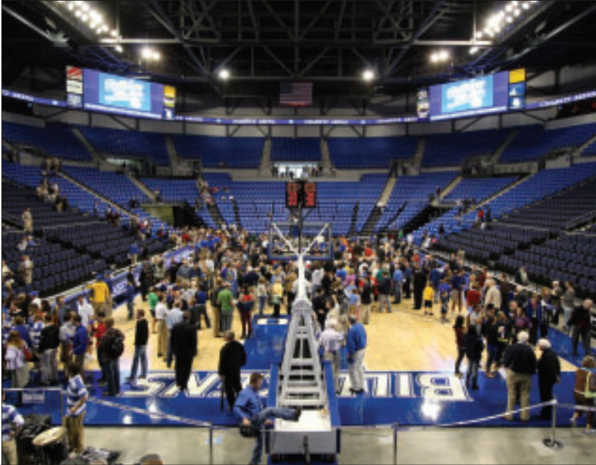
SLU's Chaifetz Arena

■ Gateway International Raceway features a 1.25 mile track, a quarter-mile drag strip, and a 1.6-mile road circuit. The Track hosts over 300 events per year, bringing in over 500,000 fans, and is one of only a few facilities in North America that can host all major forms of professional motorsports 1 .