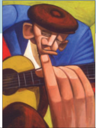
Art on the Square

■ ARTS & EDUCATION COUNCIL OF ST. LOUIS is a non-profit organization founded in 1963, which has raised over $95 million in funds from the private sector to support the arts and arts education activities in the St. Louis metropolitan area.