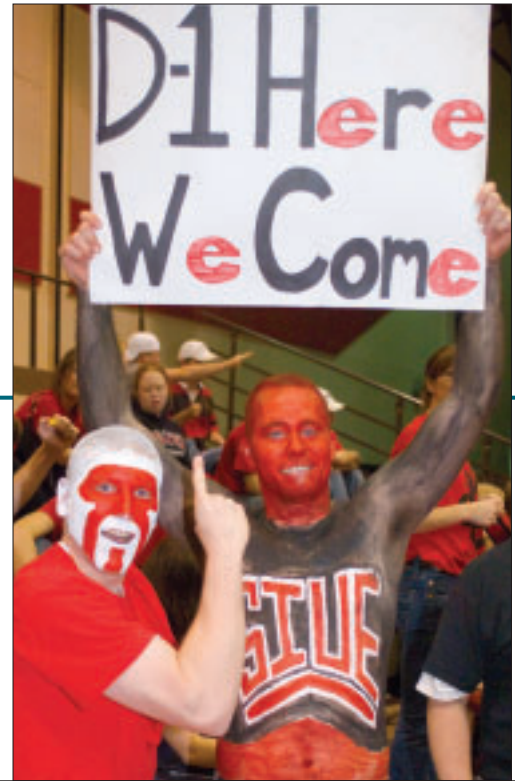
Southern Illinois University Edwardsville Cougar fans.