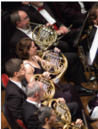
Saint Louis Symphony Orchestra

■ GRAND CENTER – from the traditional to the experimental, from around the corner and around the world, the finest in art, music and theater for the people of St. Louis.