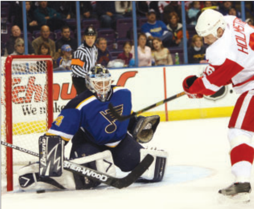
St. Louis Blues