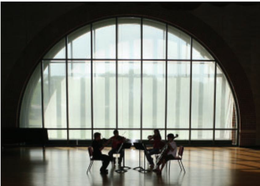
Blanche M. Touhill Performing Arts Center

■ CENTER STAGE THEATRE , a theatre arts program for college students and community residents produced by the faculty of the St. Charles Community College Arts and Humanities Division.