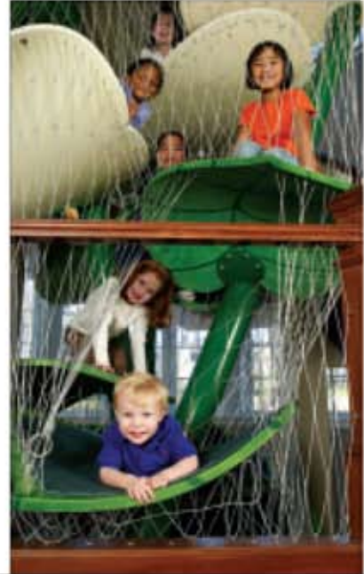
The Magic House

■ THE HOLOCAUST MUSEUM AND LEARNING CENTER houses an exhibition that provides a chronological history of the Holocaust with personal accounts of Holocaust survivors who immigrated to St. Louis.